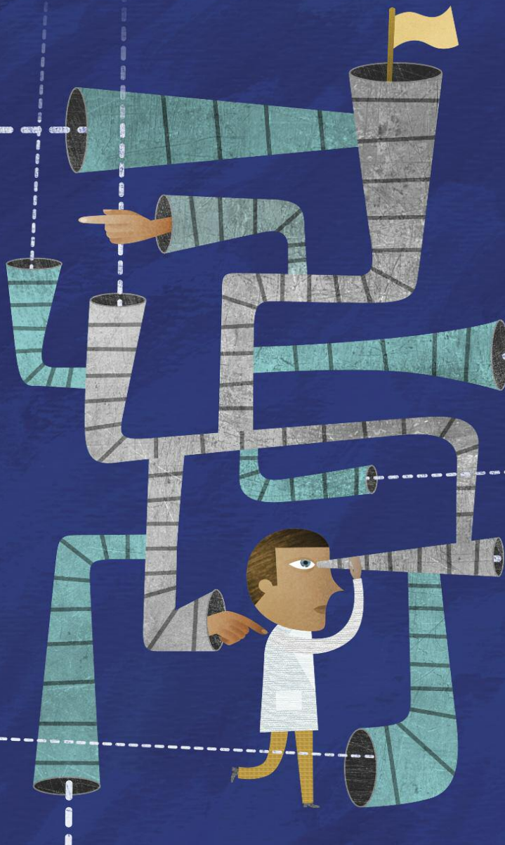
ILLUSTRATION BY JOYCE HESSELBERTH

When should you do what in your post-residency job search?